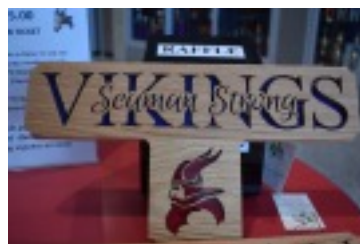
Future Alumni -who helped serve